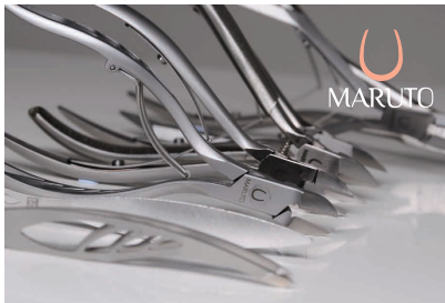
<天使の爪切り / Nail Nipper Angel>

Head Office: 16-1 Doba Sanjo-city, Niigata pref. 955-0831 JAPAN TEL(81)256-33-3010 FAX (81)256-34-7720 E-mail keiba@keiba-tool.com http://www.keiba-tool.com