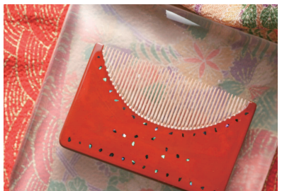
<漆櫛むげん MUGEN / Wood Comb with the lacquer>

302-3 Shimonishijo,Shiojiri-city,Nagano 399-0726 Japan yoshikaz.com e-mail: zest@rice.ocn.ne.jp