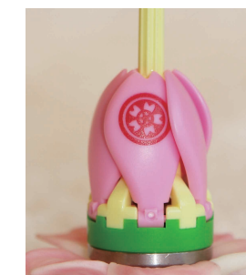
Da Vinci Brains Inc. 株式会社ダヴィンチ・ブレインズ

4-18-20 Kugahara Ota-ku Tokyo 146-0085 Japan http://www.davinci-brains.co.jp/ info@davinci-brains.co.jp