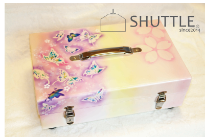
<蝶の庭 Butterfly Garden / Decorative Toolbox>

32-26 Nakashin Sanjo-city, Niigata pref. 955-0035 JAPAN http://www.nakamuraseiko.co.jp/