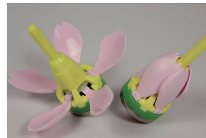
<桜コマ SAKURA KOMA ~feelware symbolic products~ / Cherry blossom Top blooming 5 petals>

7361 Tomigata Ina-city Nagano 396-0621 Japan http://www.swany-ina.com