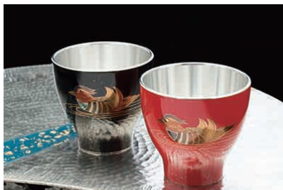
<輪島おしどり WAJIMA OSHIDORI / TIN Vessel with the lacquer>

6-6-15 Tanabe Higashsumiyoshi-ku Osaka 546-0031 Japan http://www.osakasuzuki.co.jp/ Contact : daisuzu@eagle.ocn.ne.jp