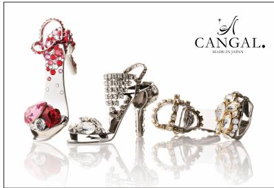
<CANGAL / Stiletto Ring-Tab Opener>

1567-14, YoshidaShimonakano Tsubame-City, Niigata Pref. 959-0215 JAPAN http://ishidafactory.com/cangal/index.html